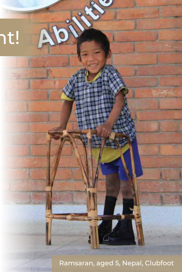
Ramsaran, aged 5, Nepal, Clubfoot

This is because your legacy gift can allow cbm to make long-term plans, and invest in cost-effective programs that reach people most in need. Your legacy will be bringing help to the world's most vulnerable children, long into the future.